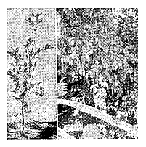
AGE BRINGS BEAUTY—Camellia oleifera at 3 (left) is the "ugly cygnet," but at 15 years (right) has become the "beautiful swan." The older plant is at Nuccio's Nurseries, Altadena, California.

*U. S. Department of Agriculture, Plant Introduction Station, Glenn Dale, Md.—Ed.